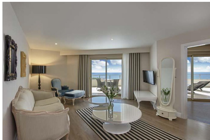
Suite Living room

Suite: in total 2 bedrooms, 58 m 2 , 1 bedroom (1 double bed), 1 living room, 1 shower / WC and terrace (Jacuzzi is located on the terrace). The features are air conditioning (central, between certain hours), hair dryer, direct telephone, LCD TV (satellite), music receiving, safe, mini bar, Laminate, kettle, tea and coffee. Every day housekeeping, towels are changed every day, and sheets are changed once every two days. View of the room: Sea Side View. (Accommodation type max: 2 adults).